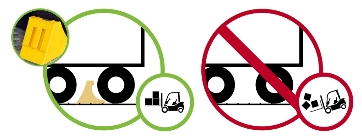
Figure 1: Example of a suitable vehicle restraint system in place (left image, green) vs. no restraint system in place (right image, red)

• Ensure that your dock uses a procedure to prevent trucks from pulling away early (e.g., ask the driver to hand over the keys until you are finished or use a glad hand device (also known as a trailer air brake lock) to lock on the brake lines)