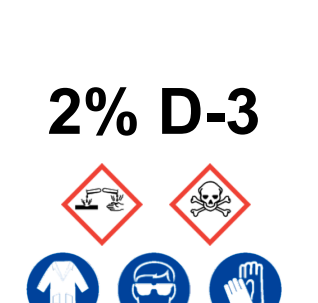
Avoid inhalation of vapour or mist. Avoid contact with skin and eyes. Refer to Safety Data Sheet