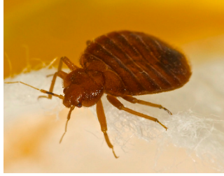
Live bed bugs

Bed bugs are typically hiding during the day, so it can be hard to spot them. Nonetheless, it's important for you and your janitorial staff to know what to look for: