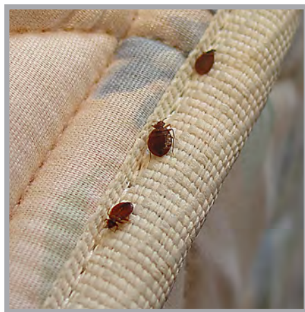
Adult bugs about the shape and size of an apple seed