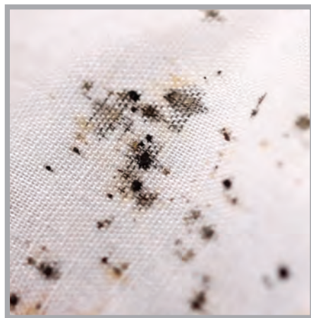
Black or brown stains, usually in crevices