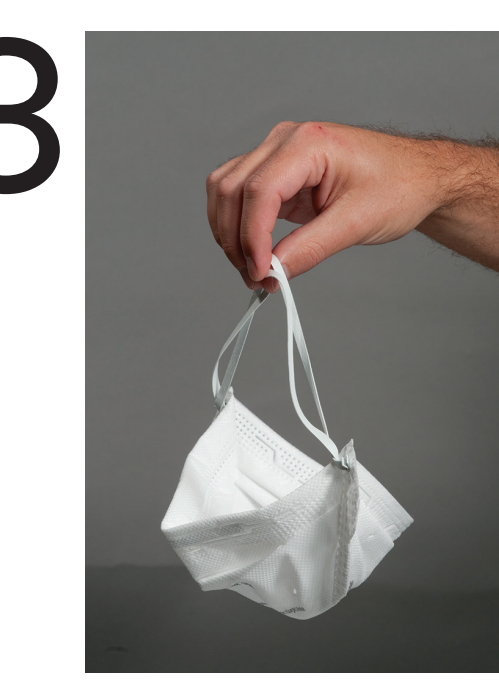
Store or discard according to your facility's infection control policy.

3M Health Care Infection Prevention Division 2510 Conway Avenue St. Paul, MN 55144-1000 USA 1-800-228-3957 3M.com/medical