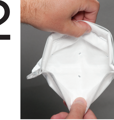
Unfold the respirator by pulling top part (with nosepiece) up and bottom part down so the respirator is open all the way. Straps should be held on the top panel.