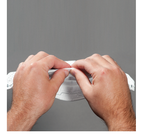
Place fingers from both hands on top side of nosepiece. Place both thumbs underneath side of nosepiece and bend slightly at center of nosepiece.