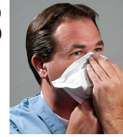
Place respirator against your face with the bottom under your chin, and the nosepiece across the bridge of your nose. Hold the respirator on your face with one hand. With your other hand pull the bottom securely under your chin.