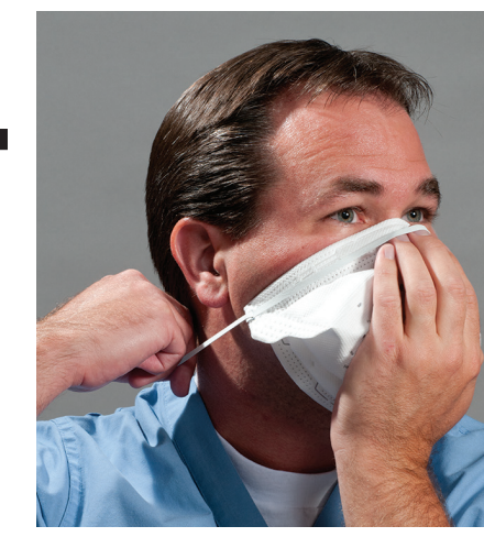
Pull one strap over your head and position it around the neck below your ears.