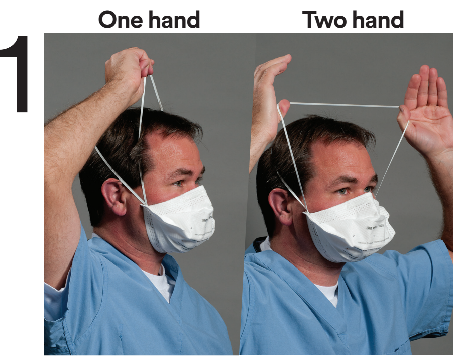
Without touching the respirator facepiece, slowly lift the bottom strap from around your neck up and over your head.