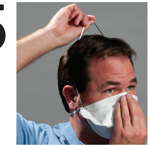
Pull second strap over your head and position it high on the back of your head.