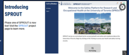
Questions about SPROUT ? Contact the EHS Office .